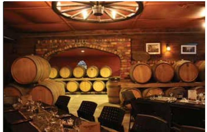
Barrel Room function package 2015